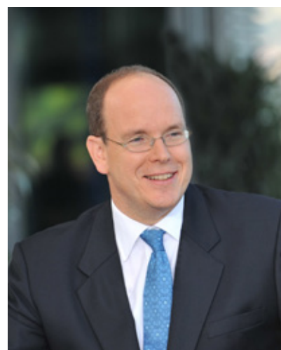
HSH Prince Albert II

The Third International Workshop on the Socio-Economic Impacts of Ocean Acidification gathered 53 experts from the natural and social sciences from 20 countries. The workshop considered how ocean acidification could affect different coastal communities and identified potential solutions. Despite uncertainties, particularly related to combined effects with other major environmental stressors, we know enough to act, and action should be taken now. This brochure summarizes the main results from the workshop discussions.